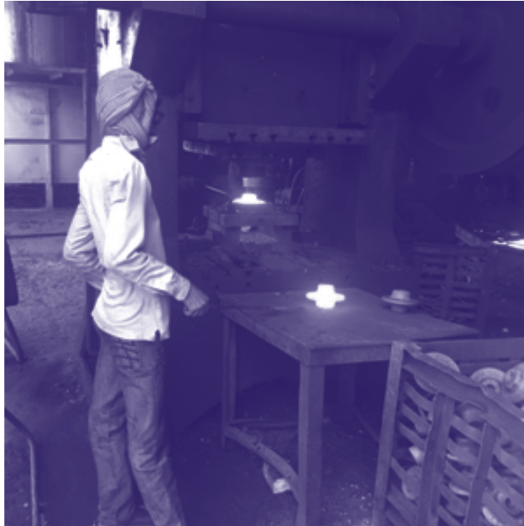
Fig. 2. Labour Employees working at drop forge hammer