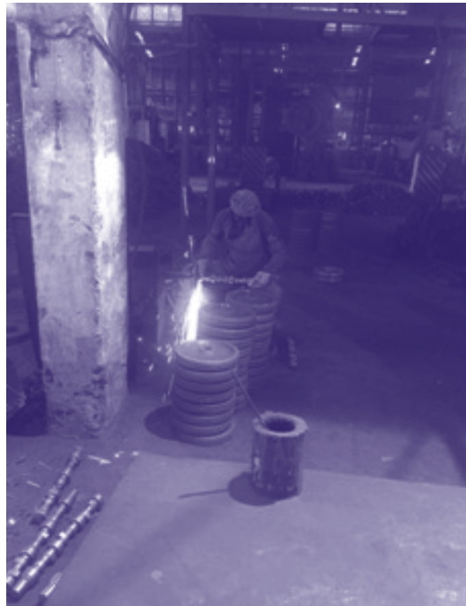
Fig. 1. Labour Employees working during grinding operation The fig 1 showed that the workers in contact with noise levels.

The data collected of heat stress in different departments in forging unit was shown in table 2 in which the temperature varies from 37 °C to 43 °C during in day time when temperature and humidity reach maximum at 2.00 pm in that day. This was more than permissible limit which was varies from 22 °C to 29 °C recommended by Indian factory act.